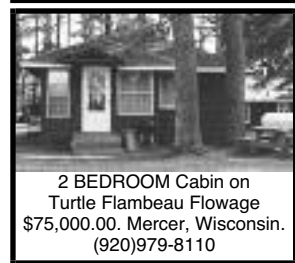
2 BEDROOM Cabin on Turtle Flambeau Flowage $75,000.00. Mercer, Wisconsin. (920)979-8110